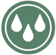
Lower Water Consumption

LIVA Reviva emphasizes on responsible manufacturing while remaining consciously fashionable. About 15-30% of fabric gets wasted during cutting & stitching of garments and most of it ends up in landfills or incinerators creating additional stress on resources, while also contributing to land/air pollution. LIVA Reviva instead recycles this fabric waste and blends with wood pulp to create a new class of fibres that offer similar properties as virgin viscose fibres.