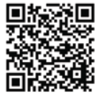
Scan to know more about GreenTrack™

LIVA Reviva fibres can be tracked across the entire journey from source to the finished garment. Our proprietary GreenTrack™ tool leverages blockchain technology to trace the upward & downward value chains, and verify through a unique molecular tracer , ensuring transparency. Partners can view this sustainability journey by registering on the GreenTrack™ page through a quick scan of the QR code and make an informed purchase decision.